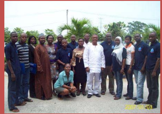
SERAC staff members pose with facilitators at the end of the retreat.

future. They also understood that worrying about where the organization will be five years from now transcends a formal strategic planning process. The direction to a brighter future is best interpreted in terms of improving the organizational capacity to deliver innovative programs and services, acquire new and improved alliances with diverse collaborators and stakeholders who exude the esteem and mission SERAC aspires. By looking at ways in which the past shapes the future, SERAC is even more determined to respond to the changes that they hope to influence.