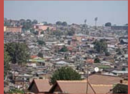
Overview of Alexandra community, Johannesburg, South Africa.

two case studies: the Federal Government's Badia East Urban Renewal Project and an aspect of the World Bank-funded Lagos Metropolitan Development and Governance Project both focused on Ijora Badia; and the Rivers State Government's Urban Renewal Programme especially the urban renewal initiatives around Abonnema Wharf waterfront community. The South African urban renewal case studies are focused on the Abahlali baseMijondolo (AbM) movement in Kennedy Road, Durban and the Alexandra Renewal Project in Johannesburg.