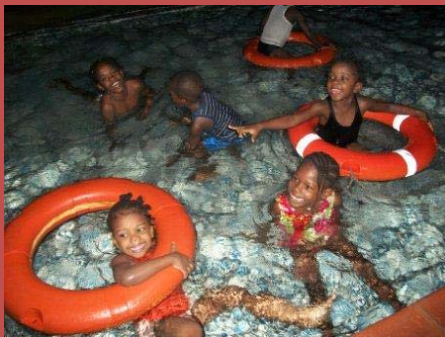
Fun time! Even children shared in the excitement.

The week-long retreat was not all about strategizing; it provided a rare occasion for