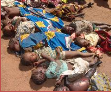
Some children slain during the crisis...

True to that prediction, Nigeria was thrown into deep mourning and confusion on Sunday March 7, 2010 following a reprisal