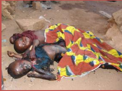
What did they do wrong? These innocent children were burnt alive...

Going by the interviews with some affected families and residents, SERAC established that the reprisal attack was unjustified and