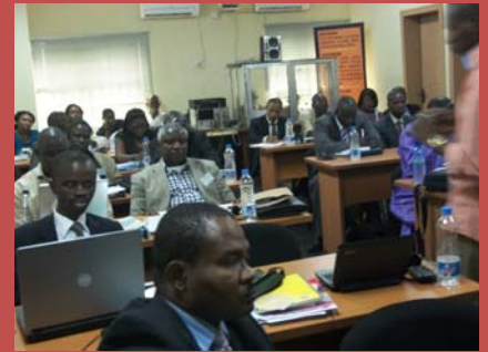
A cross section of participants at the conference.

The conference objectives were twofold: (a) to present the findings of a West Africa region-wide survey which sought to identify the challenges, opportunities, resources, strategies and support available to human rights actors and defenders in West Africa for improving the general human rights practice in places where they operate; (b) to bring human rights actors in West Africa together to brainstorm, share experiences and collaboratively explore strategies for improving the outcomes of their advocacy interventions in and around the sub-region. SERAC and the ACDHR conducted the survey between May 2009 and January 2010.