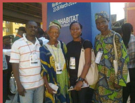
SERAC's delegates at WUF V.

Going by the discussions, it was clear that urban stakeholders shared one troubling concern: the widespread penchant among city planners to exclude slum dwellers from participating in urban policy and program decisions that affect them. The compelling stories and experiences shared by the favela dwellers of Rio underscored the inability of the urban poor to influence local decision-making and exploit opportunities that cities have to offer. Stakeholders agreed that this trend could be reversed by strengthening the capacities of the poor to participate meaningfully in development, and on the responsiveness of urban planning and policy-making processes to the needs of the poor. To actualize this, developing the necessary framework for the creation of partnerships with communities, local governments, civil society actors and the private sector is imperative.