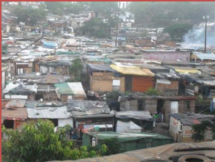
Settlements on Kennedy road, Johannesburg,

Beginning from February 2010, the Social and Economic Rights Action Center (SERAC) initiated a comparative research project on Citizen Participation in Urban Development Projects in Nigeria and South