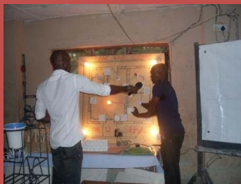
A trainee electrician exhibits a model of an electrical wiring system created during the skill acquisition program.