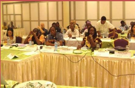
Some participants at the conference.

Building on the outcomes of the 1 st AAC held in Cairo between December 16 – 18, 2007, the human rights stakeholders came from Gambia, Egypt, Angola, Democratic Republic of Congo, Kenya, Nigeria, Algeria, Zimbabwe, Uganda, Mozambique, Morocco, Swaziland and South Africa to review the progress of the various activities implemented under the AHRS project across the five African regions; and to explore ways human rights defenders can deepen skills transfer, exchange of ideas and information and sharing of experiences on initiatives that will further strengthen