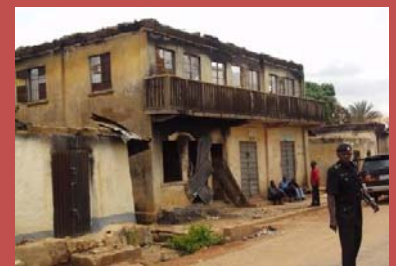
Houses were burnt, properties destroyed and residents were rendered homeless...

characterized by excessive violence. The Fulani herdsmen invaded the three villages in the Jos-South local government area of the state in the early hours of Sunday armed with machetes, guns, axes and other dangerous weapons. They shot sporadically into the air and then set some houses and properties ablaze. In the pandemonium that ensued, fleeing villagers, mostly the women and children scampered in different directions for safety. As many that ran out from their homes rammed into the rampaging