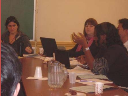
Ms. Ohaeri shared SERAC's experience with other participants.

Plenary sessions were held on the last day of the seminar to sum up the workshop discussions' findings and resolutions. The summing up activities aimed at identifying the most promising courses of action for D & P's 2011–2016 programming. Strategic programs for consideration were analyzed within the context of two dominant