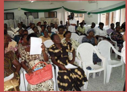
Representatives of several waterfront communities benefitted from the sensitization program.

Since 1999, the sight of bulldozers flattening houses and properties is now commonplace in Port Harcourt, River State, Nigeria. On the orders of the Rivers State Government (RSG), the densely populated Rainbow Town was reduced to rubble in 2001, leaving several thousand persons without alternative shelter, compensation or resettlement till date. In May 2005, the Rivers Government demolished a popular settlement, Agip Waterside without taking any measures to ensure that people, many of whom had lived in the area for in excess of ten years, had been given adequate or fair warning about the scale and reasons for the demolition. Njemanze community was also felled by government bulldozers in August