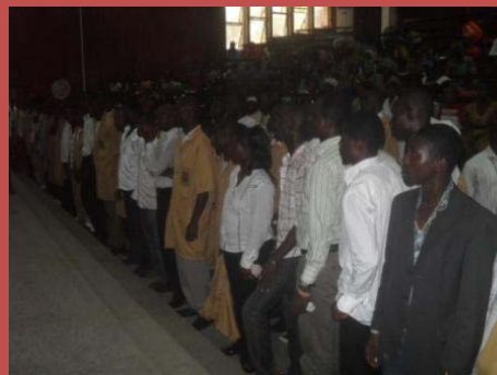
Graduants and guests at the valedictory program.

The training on housing and construction is one of the strategic components of the Nigeria Social Housing Initiative (NSHI). The Nigeria Social Housing Initiative is a comprehensive social housing, community development program that uses integrated, innovative strategies to improve both basic housing conditions, as well as the social, economic and environmental health of slum communities in Lagos. With Maroko community as the target beneficiary in the project's pilot phase, SERAC and the Urban Spaces Innovation (USI) put together the construction skills training program to effectively utilize Maroko youth in the construction process and in order to expand their skills base as well as boost their economic and entrepreneurial capacity.