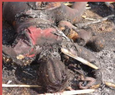
A woman and her baby were burnt beyond recognition during the massacre.

Ironically, Jos, Plateau State, is popularly known as Nigeria's " Home of Peace and Tourism " but contrary to its name and promise, the capital city has been the locale for recurrent violent conflicts, insecurity and massive destruction of lives and property. Precisely on Sunday, March 7, 2010, the capital city, yet again, witnessed the most bizarre human massacres in Nigeria's history. In the dead of the night, hundreds of residents of three villages: Dogon Nahawa, Ratsat and Zot Foron were butchered by Fulani herding populations in the deadliest fashion. About five hundred persons, mostly women and children reportedly lost their lives and homes during a raiding operation that lasted only three hours. Families of deceased persons buried their dead even before the deaths were registered, bringing the official death toll into question.